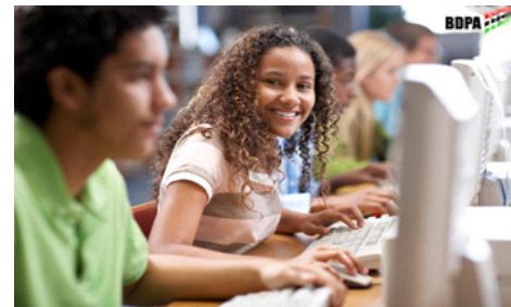
National High School Computer Competition August 2011—Chicago, IL 800.727.BDPA (2372) | www.bdpa.org

NBDPA , formerly known as Black Data Processing Associates, was founded in 1975 to promote professional growth and technical development for those in or entering information, communications, or technology (ICT) oriented fields of interest and related industries. BDPA Chapters publish quarterly or monthly newsletters. For newsletter or web portal advertising rates, publication schedules, online calendars, and e-newsletters, contact regional or local BDPA offices by visiting www.bdpa.org or by calling 1.800.727.2372 (BDPA) . bdpatoday (ISSN 1946-1429) is published by participating Local Chapters of NBDPA with their respective chapter Communications Committees, mailed to BDPA members, BDPA corporate sponsors and electronically delivered to BDPA Chapters and Chapter Interest Groups (CIGs) as a benefit of membership. First Class and Periodicals postage paid at Washington, D.C. and additional regional mailing offices. Unless otherwise noted by own copyright, art and graphics © NBDPA, © BDPA-DC, © Corbis, © Getty Images, & ©JupiterImages™. Cover graphics, photos and logos: The White House, BDPA-DC and bdpatoday . bdpatoday is available for immediate online publishing of ICT industry, chapter news, and community IT events. Send ads, articles, events, or images to: info@bdpatoday.org . Readers also may use Groupsite calendars, enhanced by Groupsite.com to review local events.