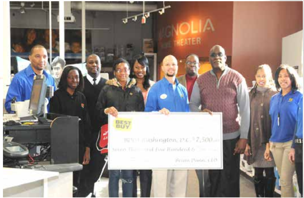
Best Buy Children's Foundation 2013 & 2012 Grants to BDPA-DC as new Sponsor in 3Q11 Community Outreach , HSCC, ITSC, and STEM