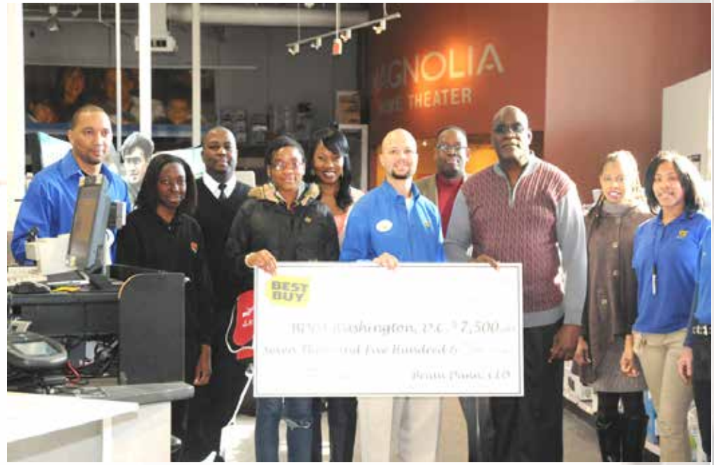
Best Buy Children's Foundation 2013 & 2012 Grants to BDPA-DC as new Sponsor in 3Q11 Community Outreach , HSCC, ITSC, and STEM